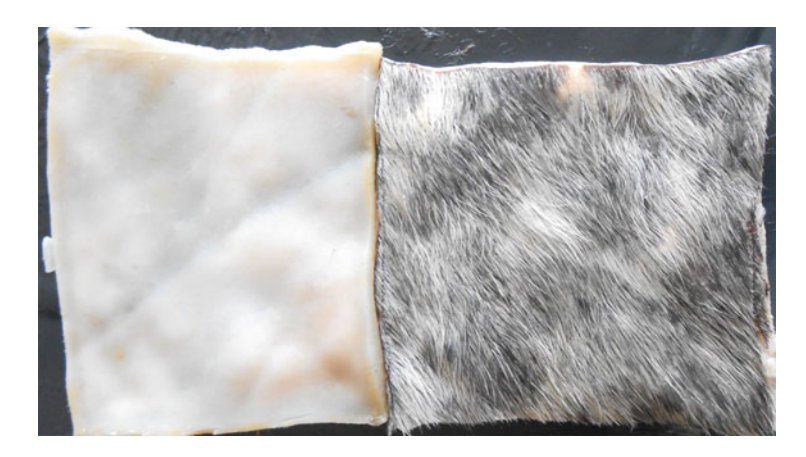
Fig. 3 Photograph of hide completely dehaired by crude alkaline protease within 3 h (pH 12 and 37^{\circ} C); negative control where distilled water under the same condition remained with hair

Skin (or hide) is usually considered to comprise of three layers. On the surface of the intact skin lies the keratinous epidermal layer comprising the epidermis and its appendages (hairs, hair root sheaths, etc.). Immediately below it, the basement membrane is to be found, attaching the epidermal layer to the underlying dermis (or corium). During leather processing, the corium is transformed into leather [43]. The proteolytic enzymes remove the hair by attacking the proteinaceous matter adjacent to the base of the hair root [44]. The ability of protease to digest the basal