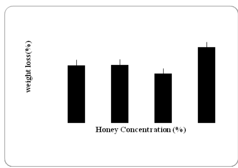
Figure 2: Effect of honey concentration on weight loss of sliced pumpkin fruits at room temperature.