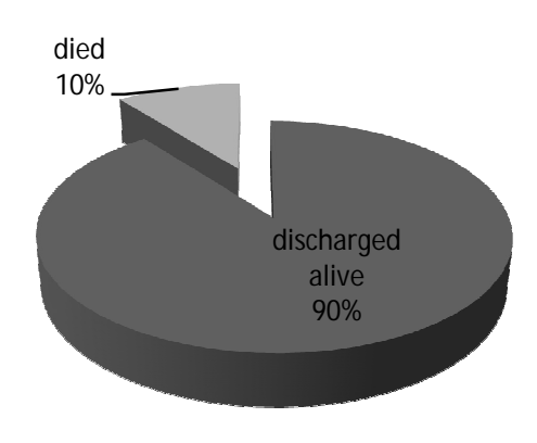
Figure 2: ICU Treatment Outcome