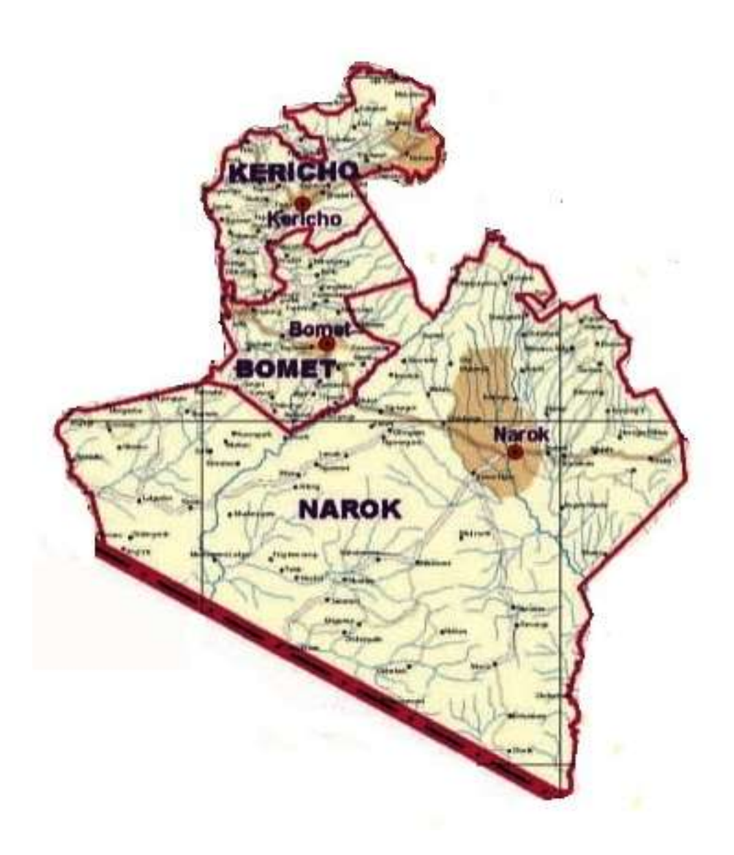
Appendix II Location of the study, Map of South Rift, Kenya