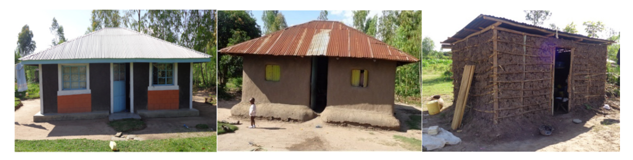
Fig. 2. Houses sampled for mosquito collection.