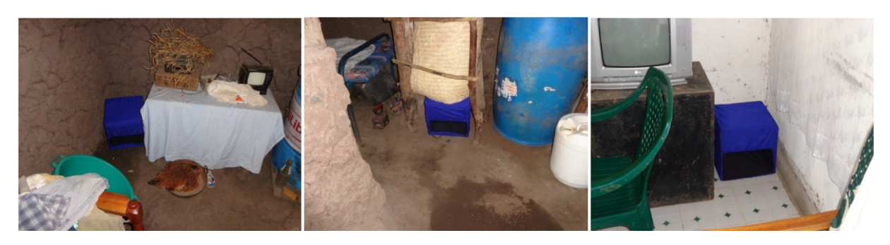
Fig. 4. Simple mosquito resting boxes in experimental houses.

Overraly, very low numbers of mosquitoes were retrieved from the boxes. Two explanations would service for this observation. First it is obvious most of the mosquitoes left, leaving those that had visited the boxes shortly before capture. Earlier, <u>Matowo</u> et al. (2013) had demonstrated that mosquitoes spend about 30 min or less in resting boxes and it was logical to catch only a few mosquitoes that had visited the boxes 30 min before collection. In the current study the boxes were set and left in the experimental house overnight and were only visited once in the morning almost 12 h later. Given that the mosquitoes visited the boxes in