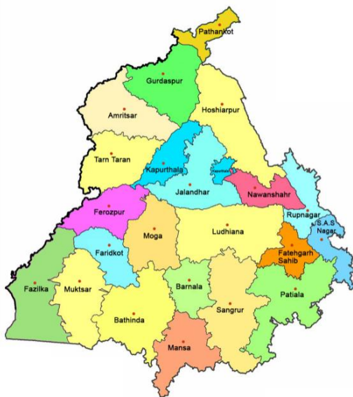
Fig.1 Punjab State (source 2020 Government of Punjab)

The research was carried out in the state of Punjab, India, and Nakuru County, Kenya.